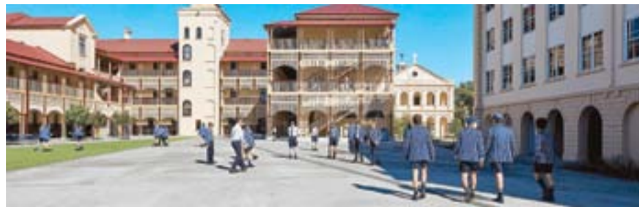
Boarding is a way of life for the students at St Joseph's Nudgee College.

"Simply put, Nudgee College Boarding is truly the heart of the College," he said.