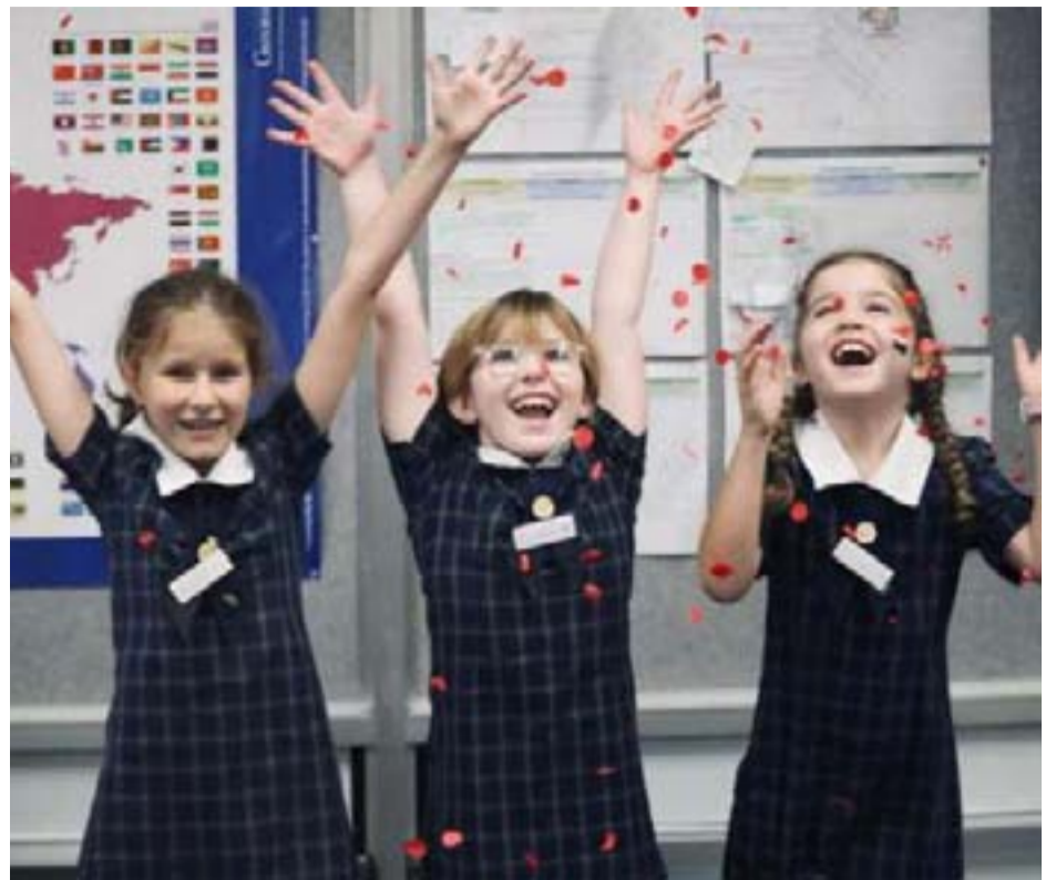
Girls Grammar aims to provide the best learning experiences.

Whole class and small group discussions allow opportunities for