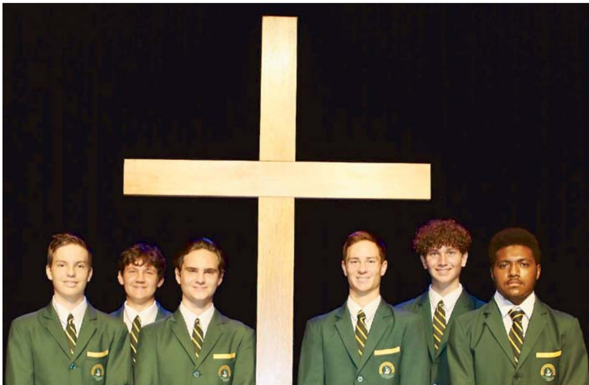
St Brendan's College is an all-boys day and boarding school located in Yeppoon.

St Brendan's College is confident that in providing a well-rounded education in partnership with parents and families, the young men of the College will enter the world with the knowledge, confidence, values and skills to make a difference.