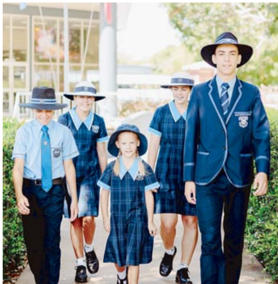
Blackheath & Thornburgh College students.

school. The transition is not always smooth and can have some ups and downs as students and their families adjust to a new environment. Our boarding team has worked to develop communication pathways and opportunities to connect with parents alongside initiatives to promote a healthy and positive environment for their boarding communities. Students have access to high quality nutrition, comfortable living conditions and a range of active opportunities to keep the blood pumping and minds moving. Whether it's volunteering with the local cricket club to prepare fields and facilities, supporting our P&F ladies in the canteen at the sale yards, assisting behind the scenes at the local eisteddfod or lending a hand for the annual show our boarders have regular opportunities to actively engage with the community.