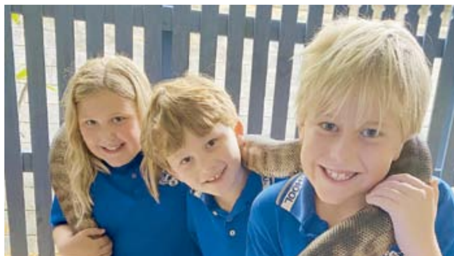
The school is situated on 10.9 hectares of land.