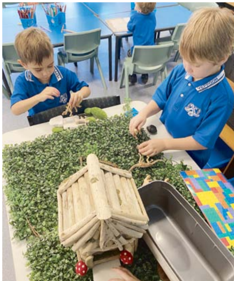
Yeppoon State School believes every student can succeed.

This is why "Tomorrow's Success Begins Today at Yeppoon State School".