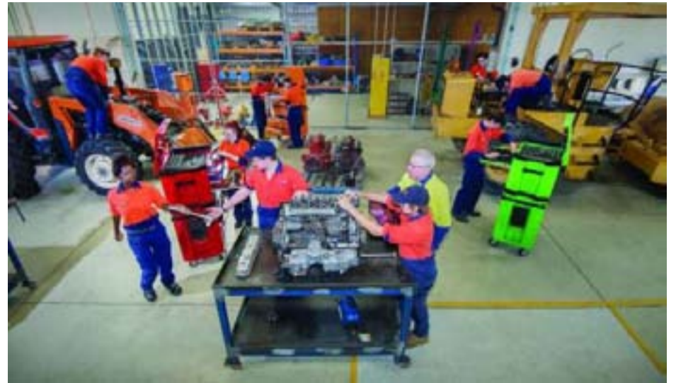
Tec NQ offers an alternative learning environment.

Students learn from professional academic and trade qualified