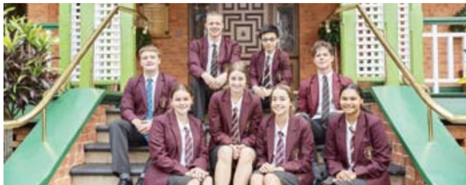
St Peters Lutheran College has a proud boarding tradition.

From the moment new boarders set foot in the boarding house