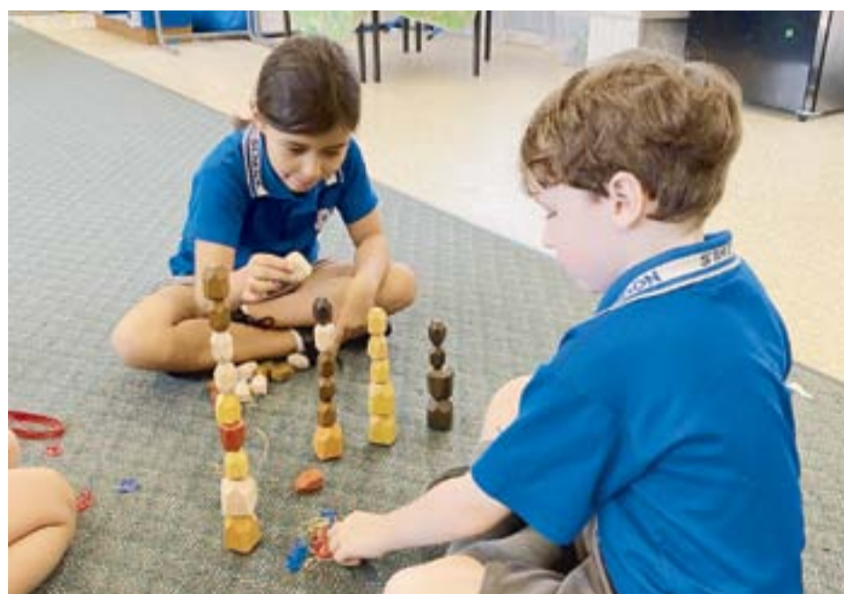
The school offers education from Prep to Year 6.