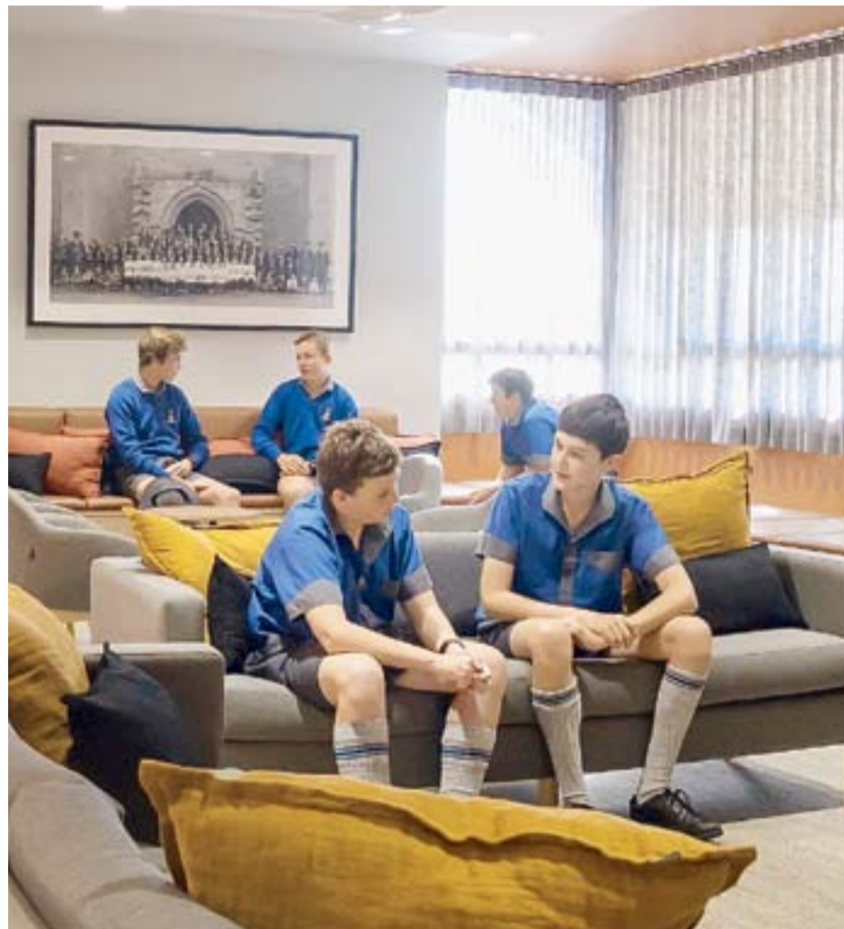
Boarding students enjoying the new common area in Goodwin House.

To learn more about a Churchie education for your son, contact Churchie Admissions on 07 3896 2200 or email admissions@churchie.com.au . You can also take a virtual tour of Churchie's boarding facilities at churchie.youtour.com.au .